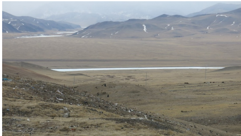
Waste comes to river from Muren's nearly 100 year old dumpsite

Oyuntsetseg's proposal has two components. She is asking for support to improve conditions along the river and to develop a program for high school students to participate in environmental responsibility. Improvements include reducing pollution by erecting additional concrete barriers another two km along the river to deter cars getting close to the river, creating a specific parking area for cars, installing a picnic table with shade cover, installing an eco-toilet and hiring activists to monitor the most vulnerable areas. The proposed budget for this component of the project is $2760.