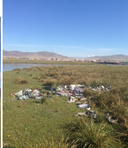
More Picnic trash