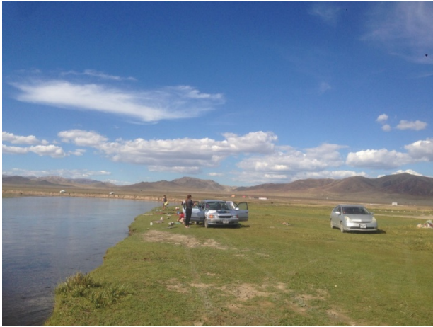
Picnicking along the river, leaving trash