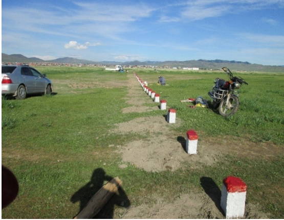
Proposal to add more concrete protection markers to prevent cars from getting to the river's edge.