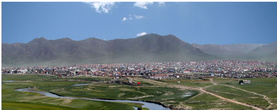
Delgermuren river south of Muren

She works in Khuvsgul province in Northern Mongolia near the Siberian border, the source of most of the water in the country, with a focus is to preserve the Delgermuren and Shishged watershed areas. The most polluted area of the rivers is the fifteen km near Muren, the provincial capital. There are about 72,700 residents and about 1.2 million livestock in the watershed area.