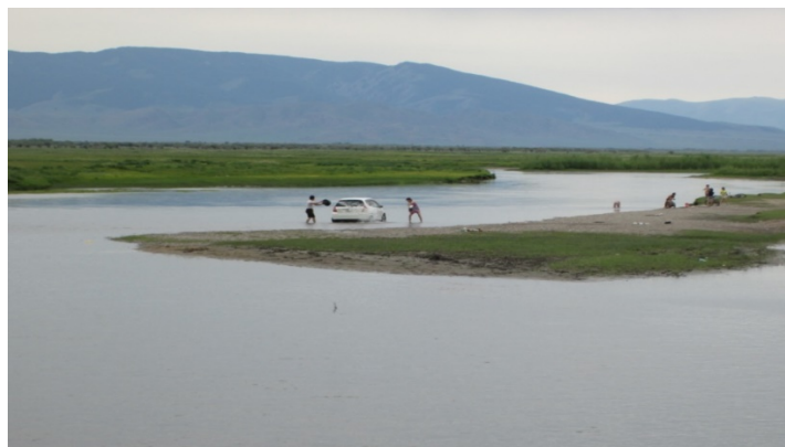
People wash their cars even though it is against the rules and cars leak liquid oil waste in the water

Sources of pollution are unpaved roads, unauthorized washing of cars in the river, picnicking and leaving trash, lack of sanitary facilities, pollution from a 100-year-old town dump site, and dumping of winter coal refuse.