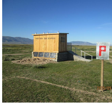
Add an eco-toilet for visitors to use. One was previously built and it was destroyed by vandals who probably didn't understand its function.

The second component of the project is an education program involving high school students in creating a public service campaign to raise awareness throughout the community about the need to care for their river. This project is expected to cost about $1857.