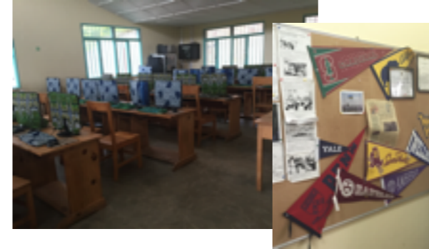
Gashora Acad. for Sci & Tech