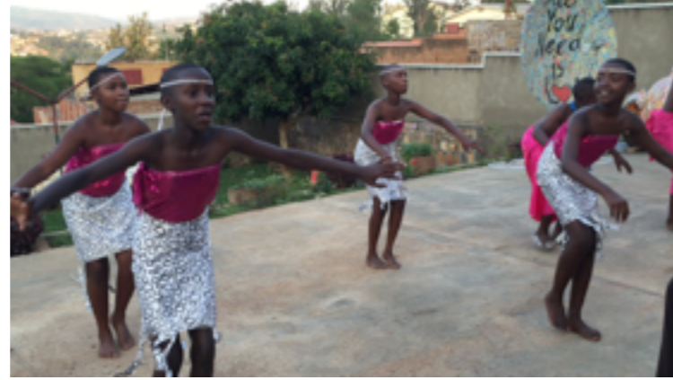
Inema Art Center